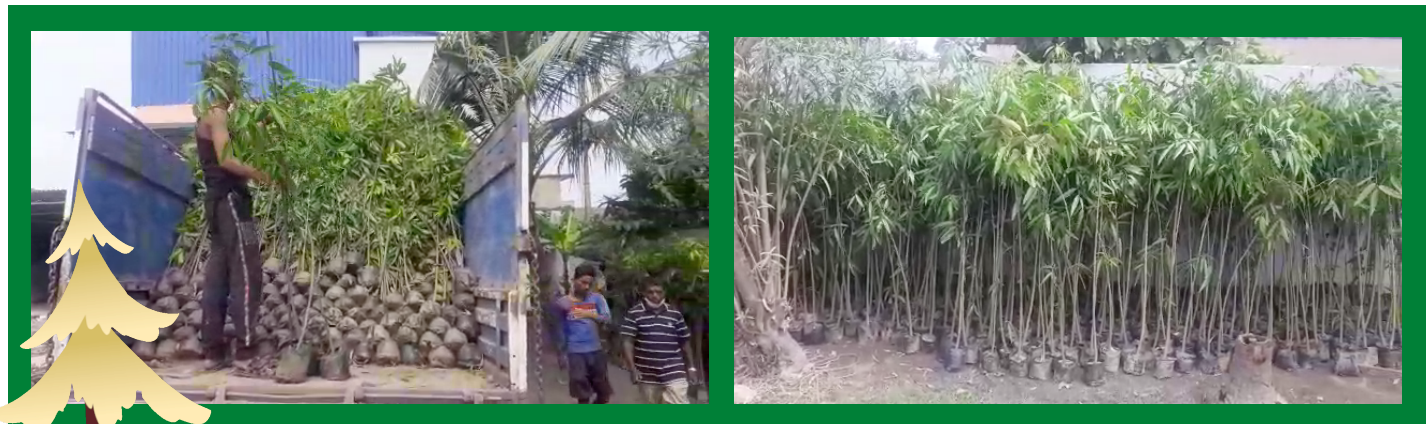
Trees unloaded at Rtn. Sanjay Choudhary's factory to be planted next week in Kolkata.

Ecobricks is one of the way in which we can divert these single use soft plastics from entering the biosphere. Let's together try and not let these tiny bits of polythene destroy our ecosystem. Join us to learn to make Ecobricks in a proper way.